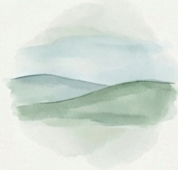
The Final Resting Place