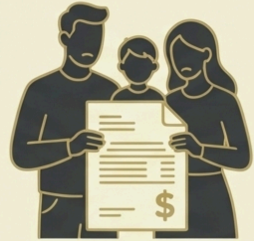
Immediate Funeral Costs