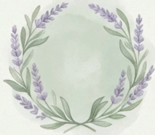
The Farewell Service